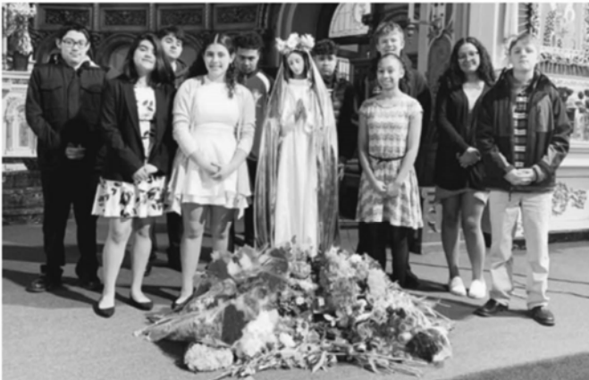
The 8th grade class of 2019 poses after the May Crowning