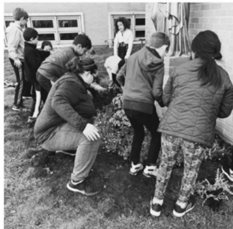
The St. Stanislaus Kostka Elementary School Garden Club decorate the statue of St. Joseph and the Child Jesus.